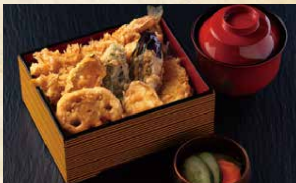
天重 Ten-ju combo

(全品みそ汁・香物付き) Come with miso soup and Japanese pickles when you order combo.