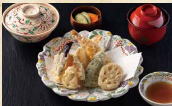
天ぷら定食 ¥2591 Tempura combo (税込 ¥2850)