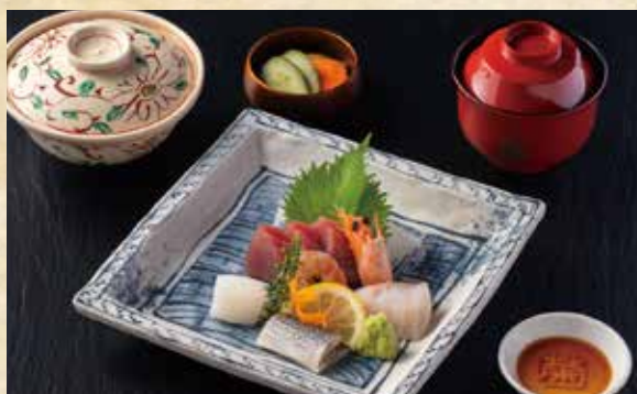
刺身定食 ¥2500 Sashimi combo (税込 ¥2750)

みそ汁をおすましに変更 Change miso soup to clear soup +¥0