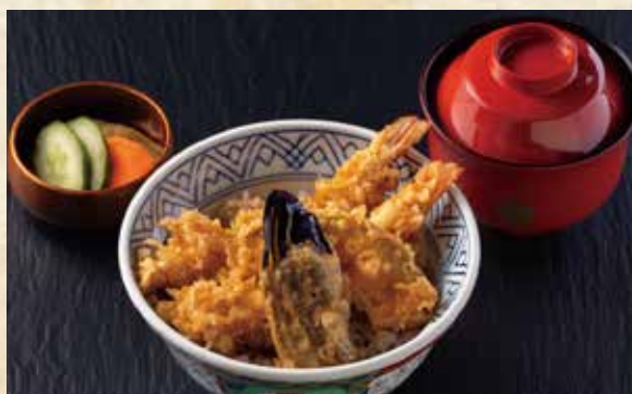
天井 Tendon combo